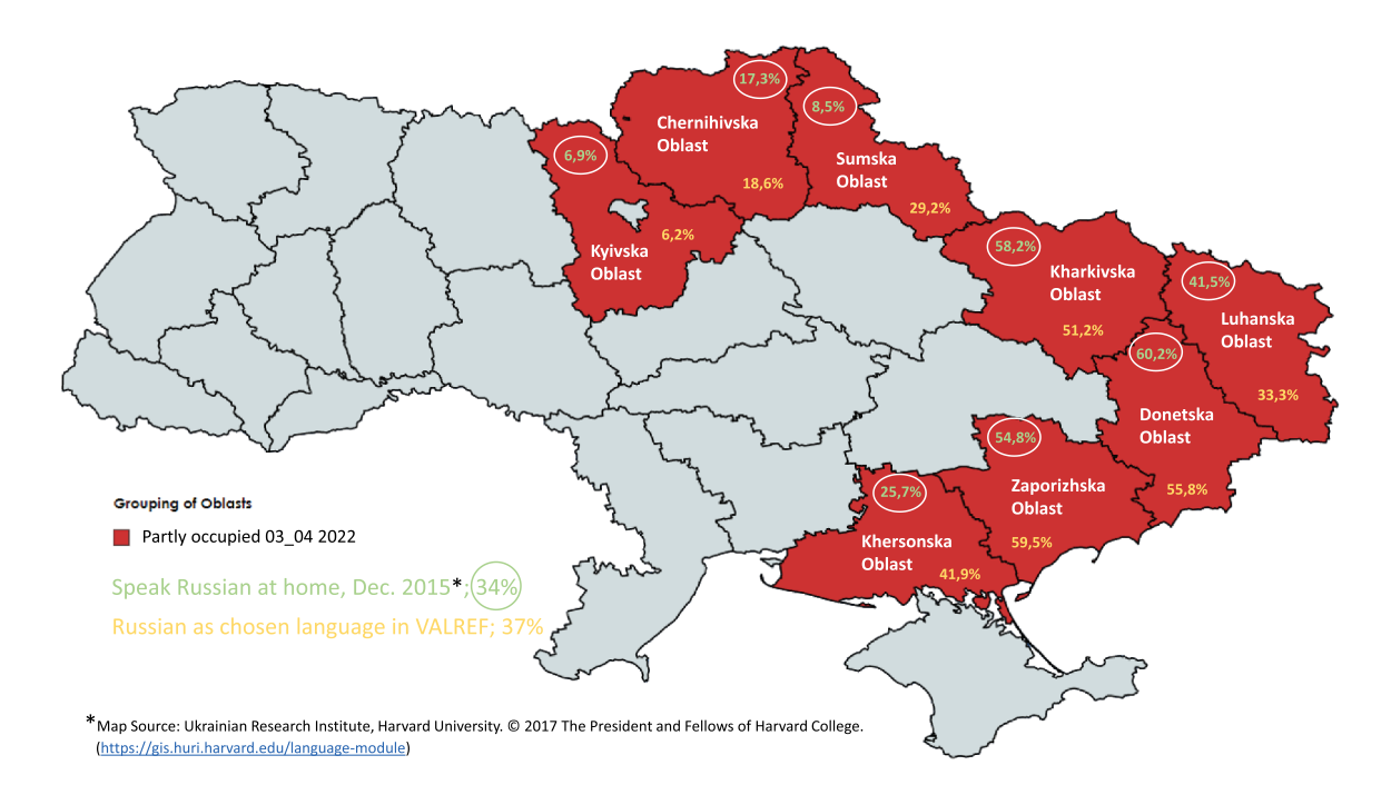
Figure 2. Share of Russian speakers in partly occupied oblasts.

As shown in Table 2, and indicated in green, we can reject the null hypothesis ; the respondents in eight partly occupied oblasts (Figure 2) answer differently from the respondents in