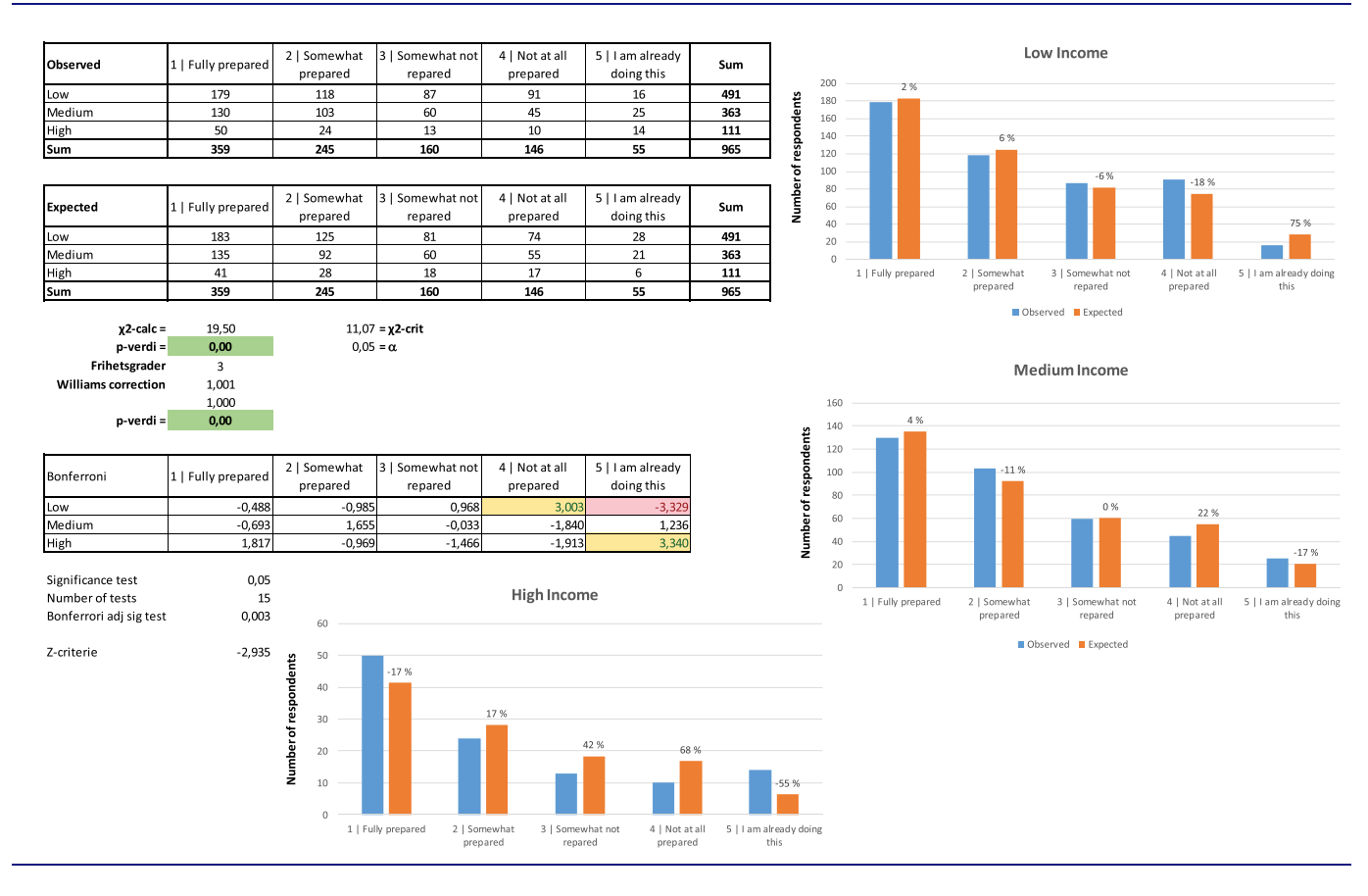
Table 6. Chi-square Test and Post Hoc Test with Bonferroni Correction on Q2