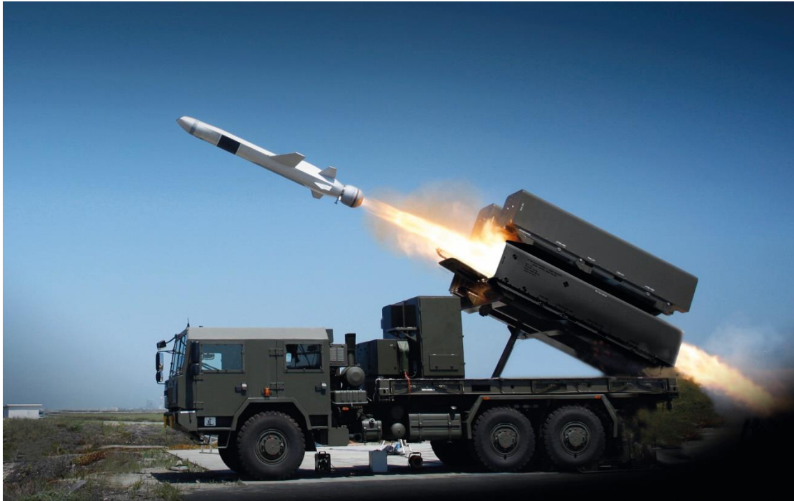
Figure 3.1 Shooting NSM missile from a launcher mounted on a truck