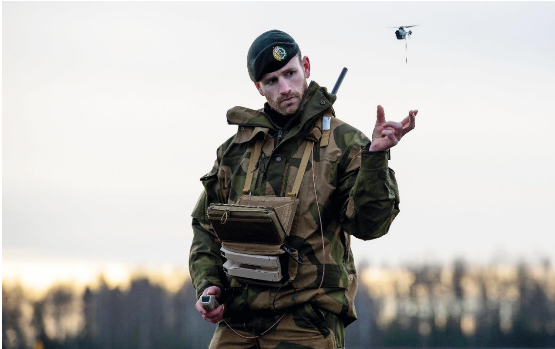
Figure 1.1 Instructor at the Royal Norwegian Air Force Tactical Flying School performs tests on Black Hornet drones