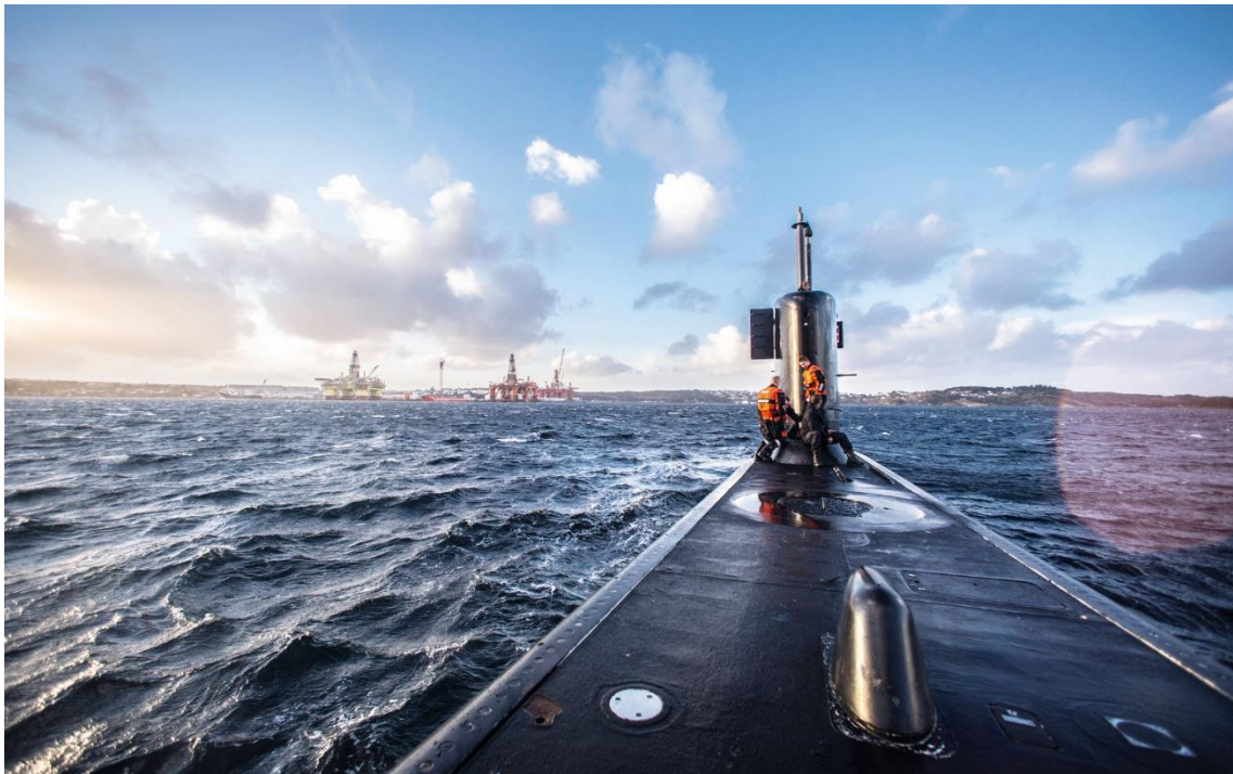
Figure 3.2 Day sailing with HNoMS Utvær submarine.