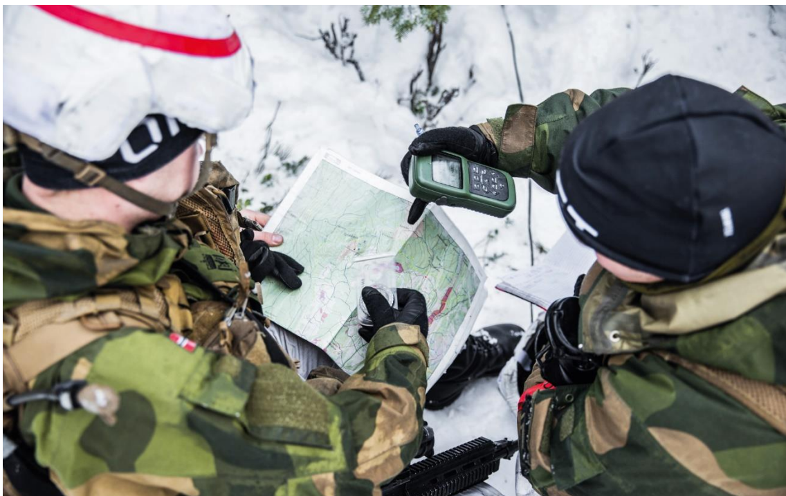
Figure 1.2 The guardsmen in HMKG, scout the area to find a good position for a relay installation