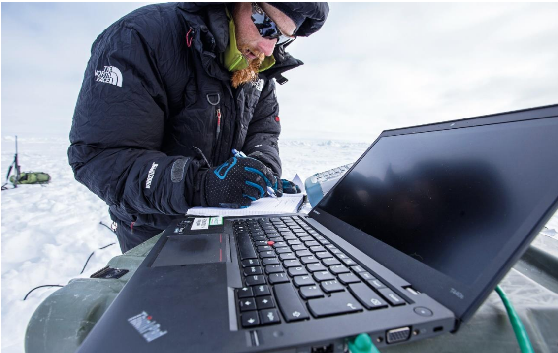
Figure 4.1 Norwegian Defence Material Agency tests satellites north of Svalbard.

major potential for innovation and radical change in the interaction between these technologies. This type of progress will add major value to a number of defence activities, from optimising the performance of military equipment to reducing costs and improving methods of conducting military operations.