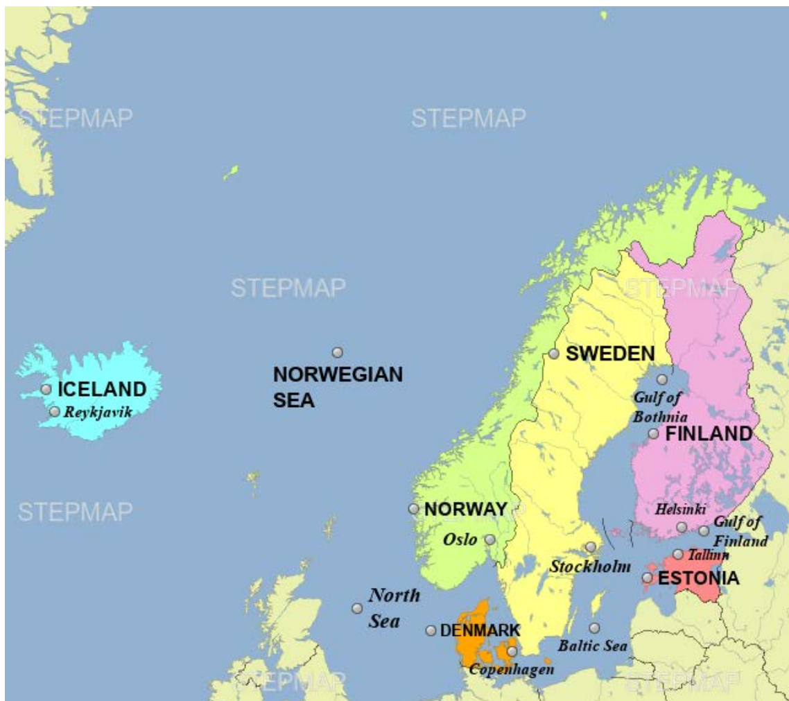
Figure 2.1 The Nordic Countries and Region.